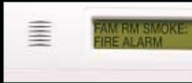
Voice Warning System